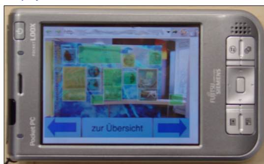
Figure 1: Pocket Loox 720 handheld device with display of one of the four exhibition walls.